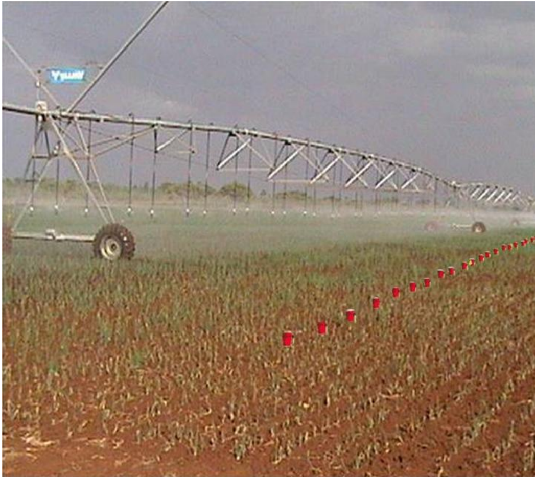
Figure 2. Catch cap lay out

\sum X is summation of deviations from the mean depth collected, m is the mean depth collected and n is the number of observations